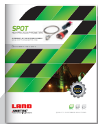
SPOT FAMILY PYROMETERS

SEE OUR OTHER LITERATURE ON SPOT MOUNTINGS & ACCESSORIES AND SPOTVIEWER SOFTWARE: