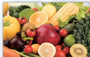
Fruit and vegetable transportation